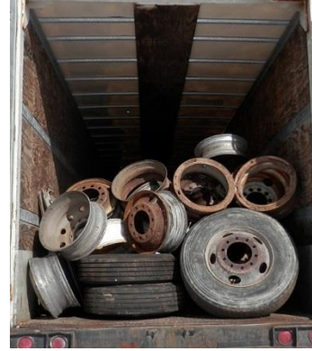
Rubber for the road.... Lots of it! Semi tires and rims including Super Singles 445/50R 22.5, 255/70R-22.5, lots of 11R-22.5, Super Twin 423 710/40-22.5—14 total (4 brand new) and lots more all told, nearly a semi load.

Also....Tanker Trailer-manufacturer/VIN not available-Farm Use. Equipped with 1979 Brenner 6700 gal. tank, 316 stainless steel head & shell, bottom side discharge pipe w/manual flow valve, pump & top shooter. '64 Freuhauf Tank Trailer, tandem axle, spring susp., 5th wheel king pin. Equipped w/'64 Cubby 3200 gal. steel tank, rear discharge pipe w/power flow valve. Onboard Dsl. Power unit. Also selling.... additional Great Dane Reefer Trailer, Great Dane Alum Flat deck semi-trailer, other van-body trailers for good rolling storage.