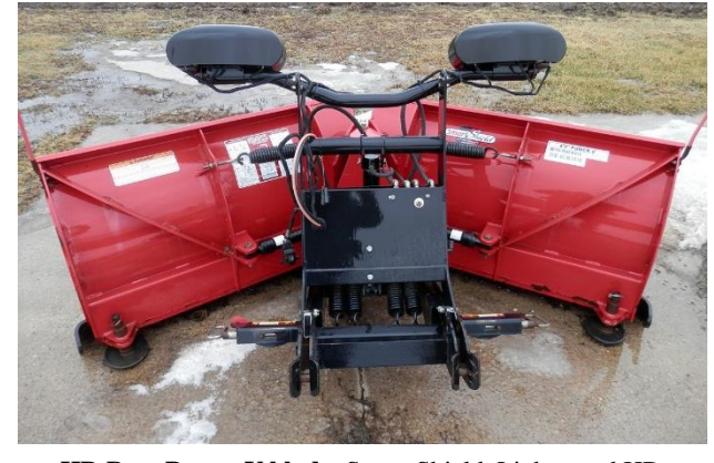
HD Boss Power V blade, Smart Shield, Lights, and HD bolt-on wrap around edge, also...older Boss V-blade.

<<SPECIAL>> Snap-On Mdl BRA8180 V air compressor, 80 gal. tank, 175 psi, 507.6 hrs. on meter—a great highend compressor and rare auction find!